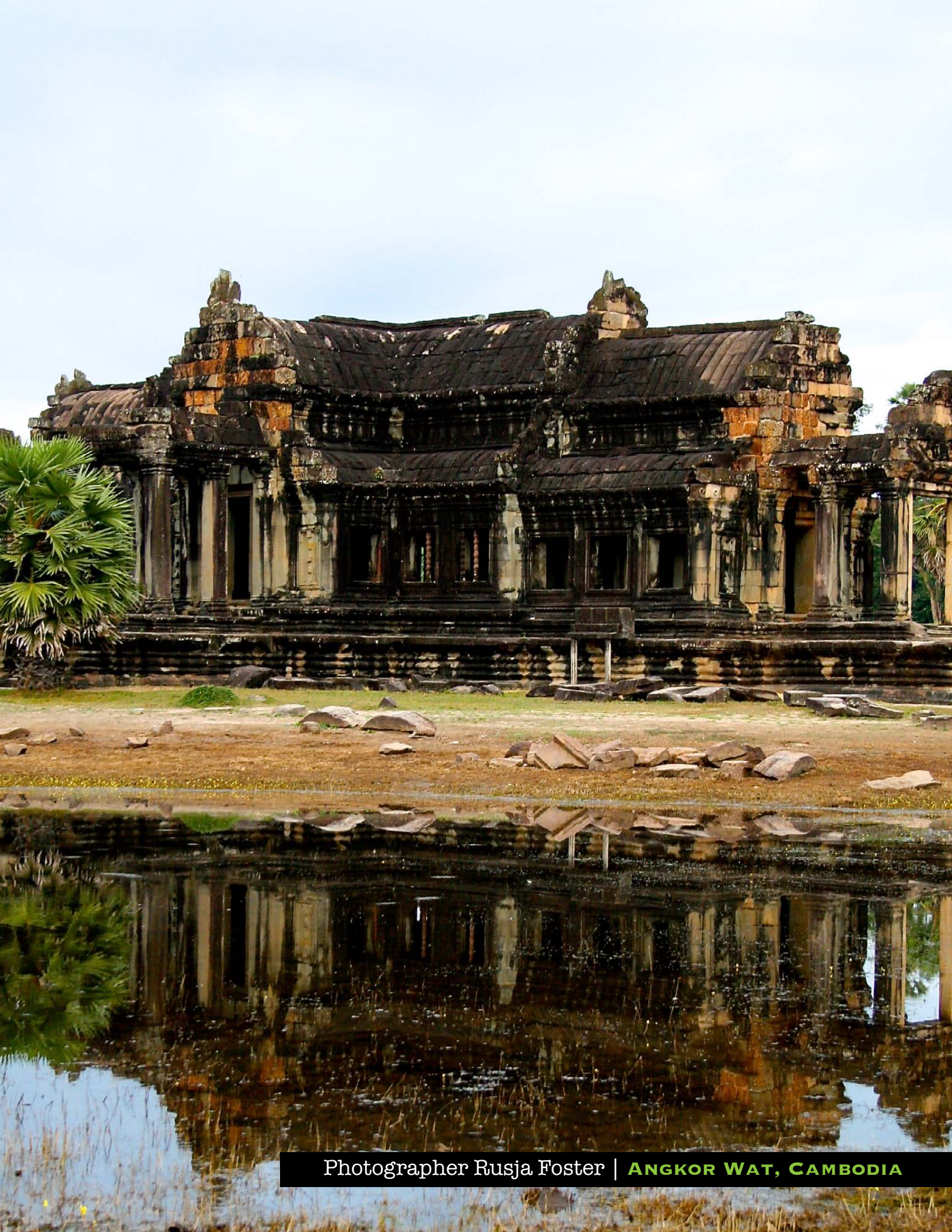
ANGKOR WAT, CAMBODIA