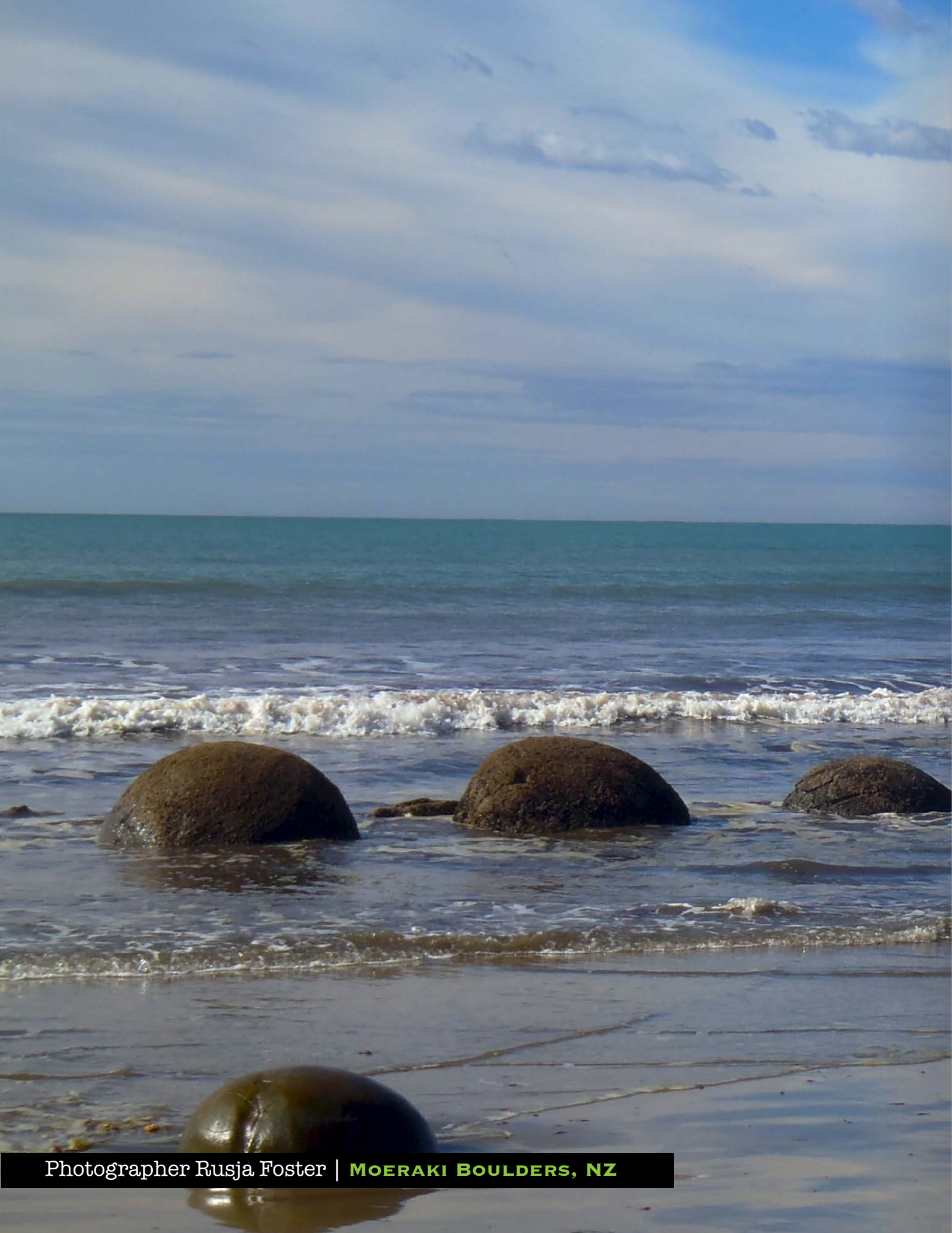
MOERAKI BOULDERS, NZ