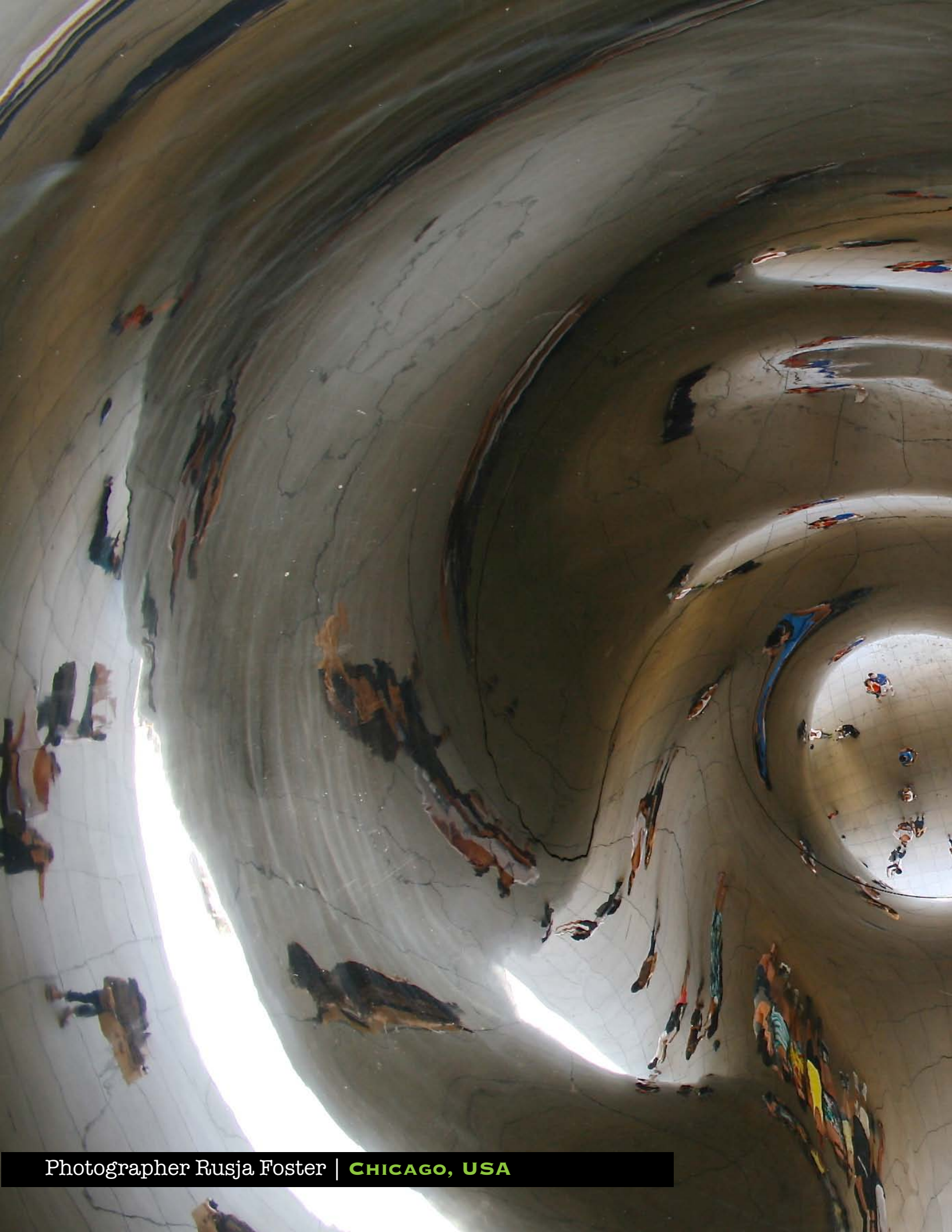
CHICAGO, USA