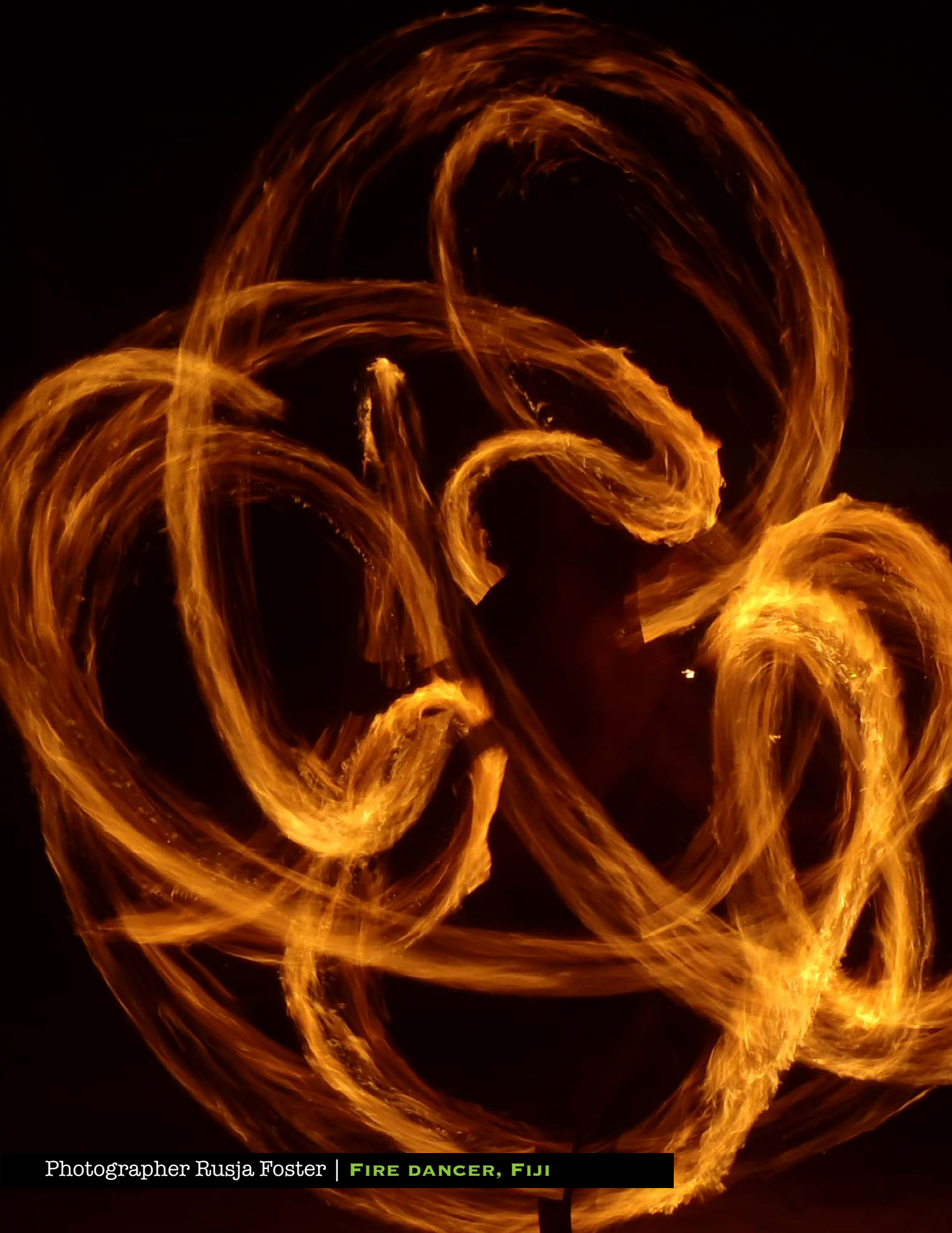
FIRE DANCER, FIJI